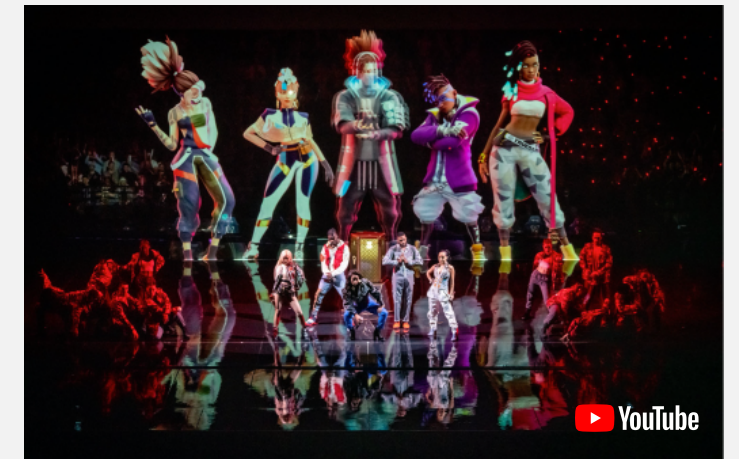
2019 World Championship Finals

Held annually since 2011, the League of Legends World Championship is the most widely viewed and followed esports competition. Four regions -- Europe, North America, China and South Korea -- have all hosted the World Championship, and seven different cities have hosted the Worlds Finals (2011-2019).